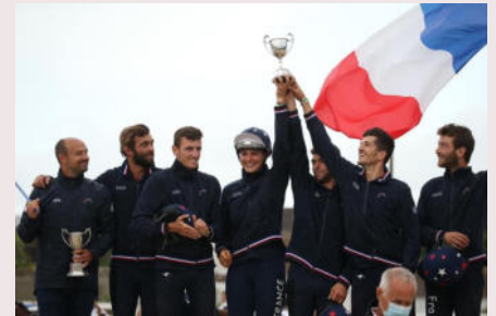
IMGA - World Team Championship 2021 - U18 Results